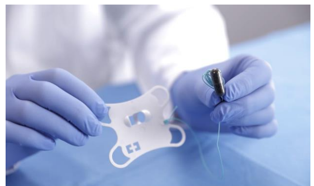
The picture shows the Cytosponge™ which is similar in size to a vitamin pill and contains a small sponge inside a vegetarian/vegan capsule attached to a piece of strong, thin thread.

The nurse will remove the sponge by pulling gently on the thread. As it is pulled out, the sponge collects a sample of the cells lining your food pipe (oesophagus).